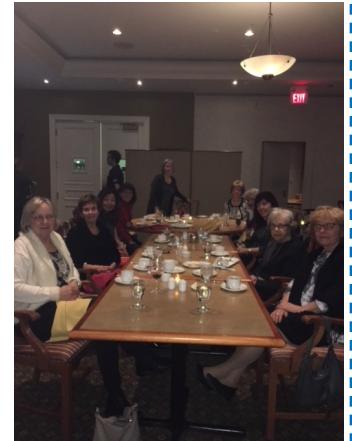
Creative Cookery Group getting ready for wine and roast beef with Yorkshire Pudding!

The Creative Cookery group met at the Brantford Golf and Country club for our annual Christmas Dinner.