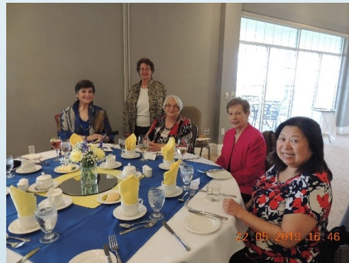
Enjoying social time before the AGM and banquet!

Next year's Ontario AGM will be held at a resort in Orillia. Perhaps we can make a weekend of it and go as a whole contingent from CFUW Brantford? Who's in? Our own AGM and Banquet was held on May 22nd at the Brantford Golf and Country Club.